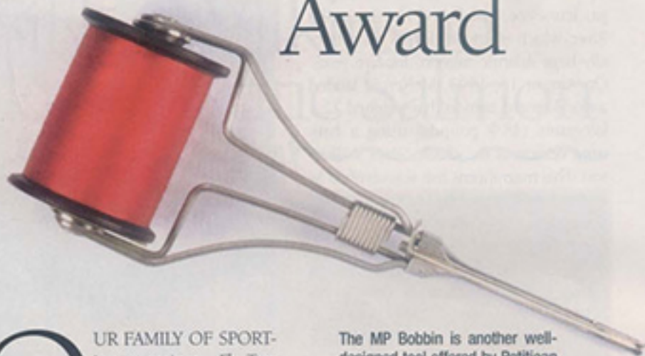
The MP Bobbin is another well-designed tool offered by Petitjean Fishing Equipment.

OUR FAMILY OF SPORTING magazines— Fly Tye , American Angler , and Gray's Sporting Journal —sponsors a large new-products showcase at the annual Fly Fishing Retailer show. Every year, dozens of dealers use this area to display everything from small midge hooks to full-size drift boats. With more than 100 items from which to choose—rods, reels, vests, waders, wading boots, float tubes, hats, fly-tying supplies, and more—it's sort of like one-stop shopping for retailers in search of new products for their stores and catalogs.